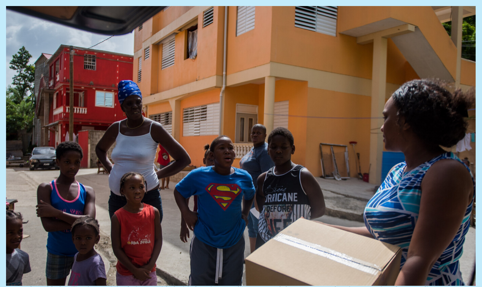
Vulnerable families in Dominica being provided with hygeine supplies as part of the response to hurricane Maria.