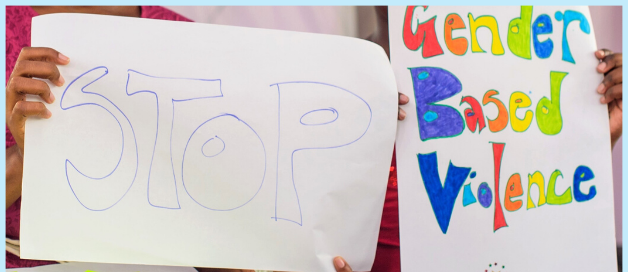
Support for survivors of Gender-based Violence training will also feature in COVID-19 response.