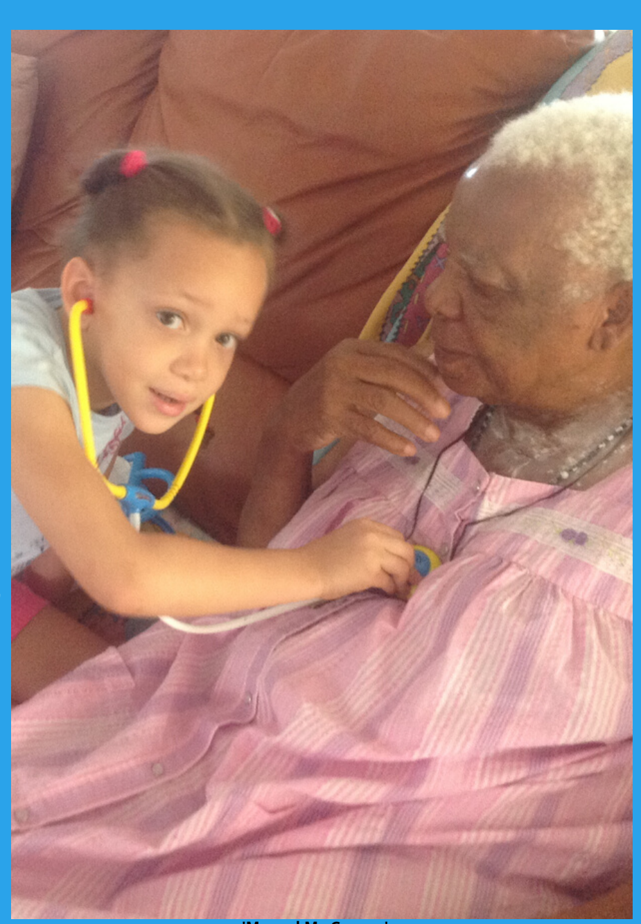
'Me and My Granny' UN Human Rights Day Youth Photo Contest 3rd Place entry from Dominica.

Additionally, as the Caribbean enters the 2020 hurricane season with a forecast that the Atlantic will have above normal activity, it is important that countries rapidly put the necessary buffers and mechanisms in place to reduce the multidimensional impact of COVID-19 and minimize the chances of exacerbating the fiscal and social challenges should 2020 hurricanes make landfall.