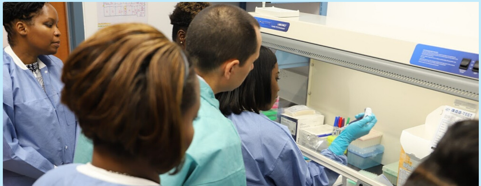
PAHO/WHO trained laboratory technicians of the Best-dos Santos Public Health Laboratory on SARS-CoV-2 in Bridgetown, Barbados. February 2020