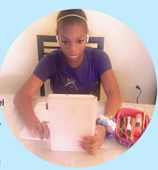
Barbadian Primary school student participating in on-line learning during COVID-19 lock down.